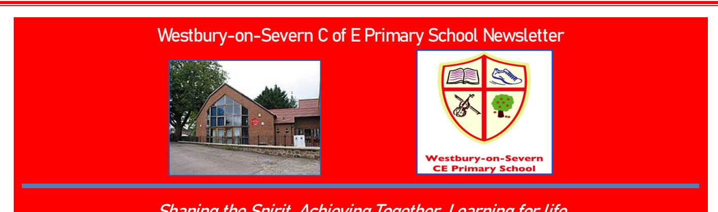
Shaping the Spirit, Achieving Together, Learning for life Thursday 3<sup>rd</sup> November 2022